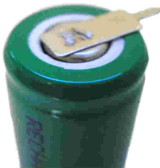
PCB PIN 6